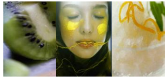
Cocktail Givré ~ Kiwi & Cranberry