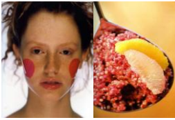
Nectar Fouetté ~ Grapefruit & Pomegranate